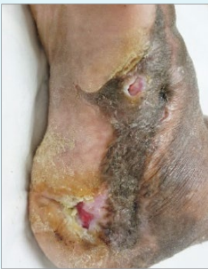
Figure 5. Day 41

The patient was admitted to hospital and the wound was treated with radical debridement and sequestrectomy on the calcaneous bone. He received IV antibiotics after debridement for 2 weeks. This led to a larger wound, treated initially with normal saline wet gauze; however, the wound showed no signs of progression and 2 days later a HRWD was selected (HydroClean®).