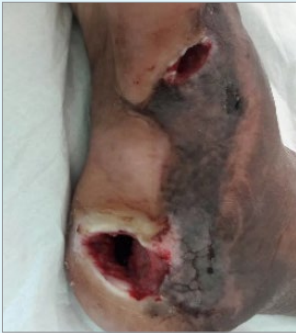
Figure 4. Initial assessment

A 55-year-old male with a 10-year history of diabetes and previous episodes of peripheral neuropathy and insensate foot, presented with a diabetic foot ulcer (Figure 4). Post-radical debridement and skin grafting had been used to treat diabetic foot ulceration on the lateral foot 4 years previously. Ulceration had occurred following trauma from a sharp object, which had lacerated the sole of his foot. The small lesion was at the margin of the skin graft and the other lesion on the heel area. The wounds were noted to have had repeated infection and were deep to calcaneous bone.