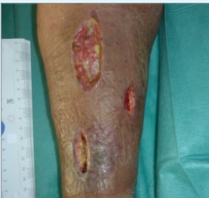
Figure 3. +4 days of treatment with Hydroclean® mini

At initial assessment (Figure 2), the patient presented with three wounds, measuring 4.5cm (length) x 1.5cm (width); 8.5cm (length) x 2.2cm (width) x 1cm (depth); and 3.5cm (length) x 1cm (width). Larval therapy was initiated, with the aim of cleaning the wound bed, followed by cold atmospheric plasma (CAP) [39] and application of a hydroresponsive wound dressing (HydroClean® mini) and an absorbent dressing pad (Zetuvit®Plus Silicone) as a secondary dressing.