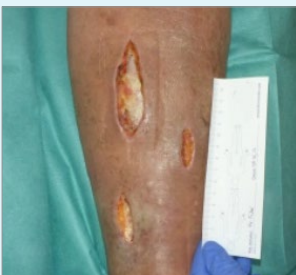
Figure 2. Initial assessment

A 54-year-old male presented with a right-sided fracture on the proximal femur and a fatigue stress fracture of the left femur. He had an abscess on the left lower leg in December 2018 and was treated in another hospital.